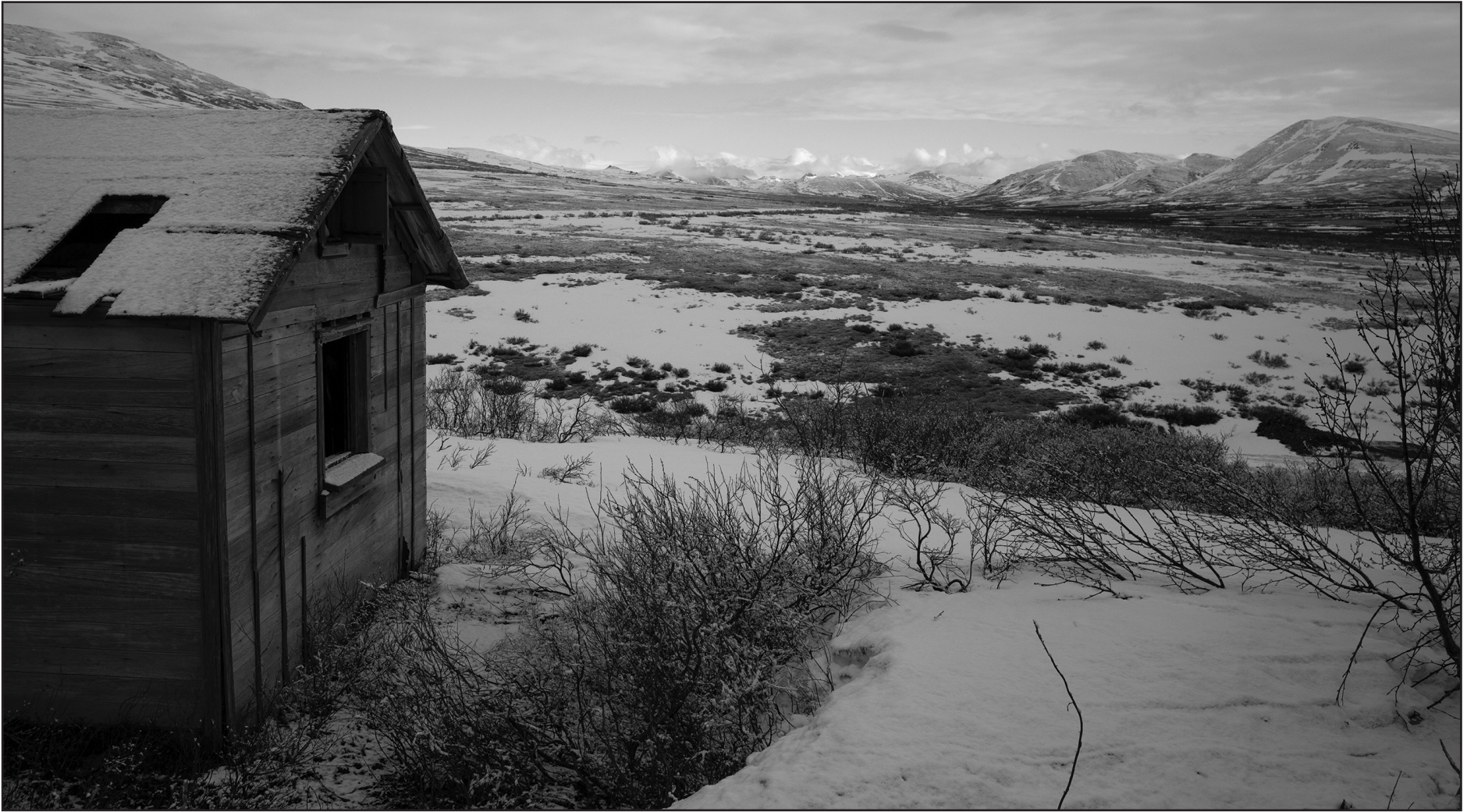
FRESH SNOW— The Kigluaiik Mountains and the tundra outside of Nome are covered in fresh snow on Tuesday, May 30.