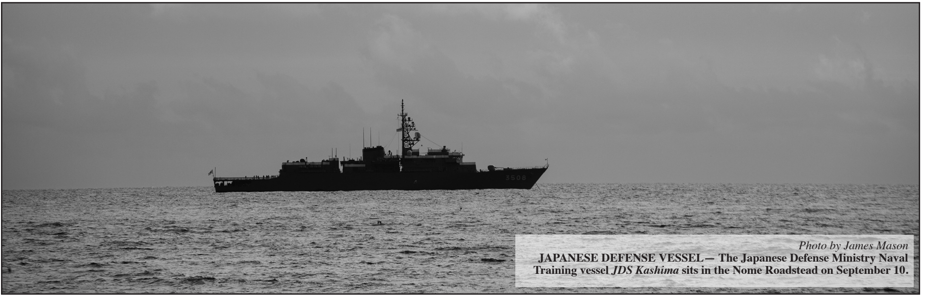
JAPANESE DEFENSE VESSEL — The Japanese Defense Ministry Naval Training vessel JDS Kashima sits in the Nome Roadstead on September 10.