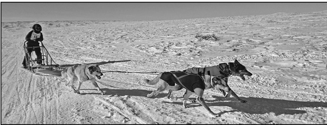
MUSHER FOR A DAY — Participants in the businessman's race could get a taste of dog mushing on the three mile loop.