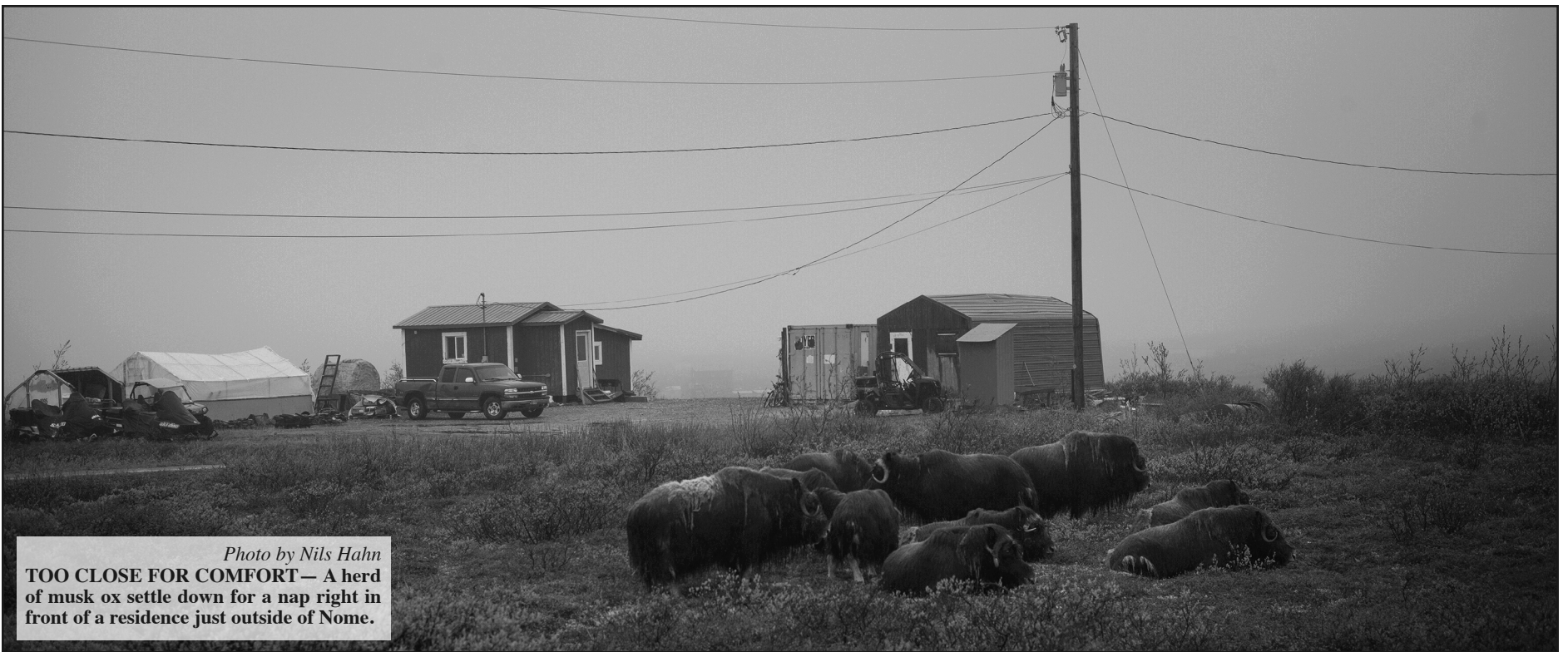
TOO CLOSE FOR COMFORT— A herd of musk ox settle down for a nap right in front of a residence just outside of Nome.